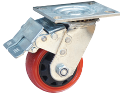
Ø75mm Swivel Brake Castor