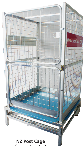
NZ Post Cage (special order)

Reduce costs in your freight and logistics operations by utilising our highly reliable and specifically engineered freight cages. Whatever your requirements maybe we can design and specify according to match your capabilities.