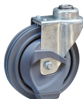
Ø150mm Integrated Wheel