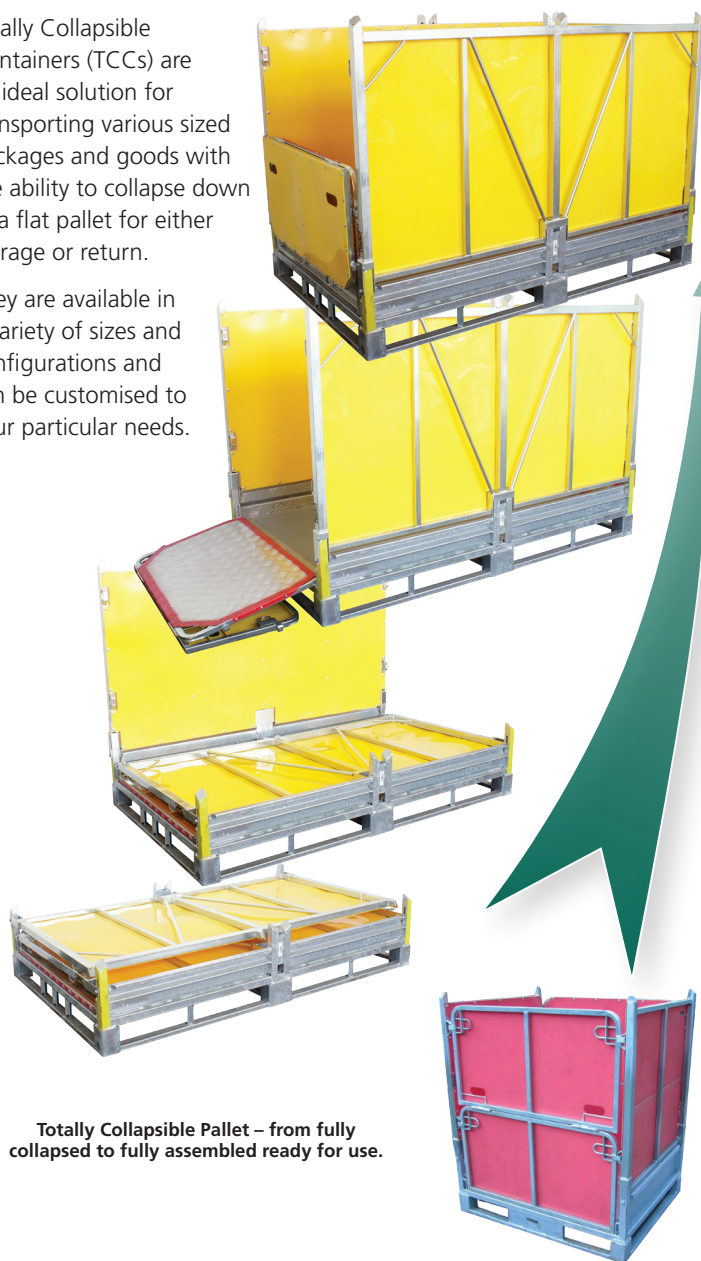
Totally Collapsible Pallet – from fully collapsed to fully assembled ready for use.

They are available in a variety of sizes and configurations and can be customised to your particular needs.