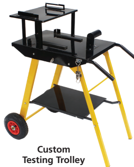
Custom Testing Trolley