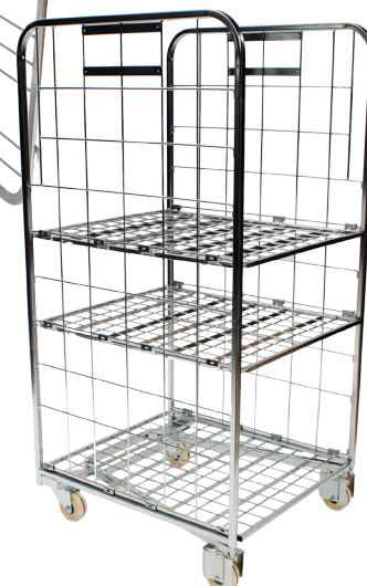
MECO369.001 Shelves not included