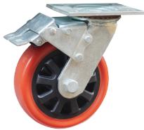
Ø125mm Swivel Brake Castor