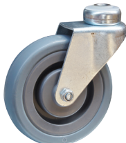
Ø125mm Swivel Wheel