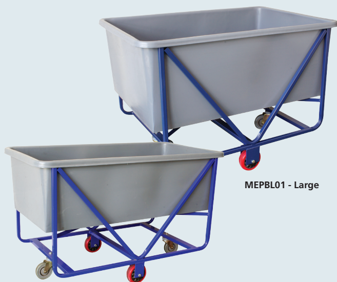
MEPBL01 - Large

Ideal for large item order picking in warehouses or storage facilities with plastic bins for easy cleaning and long life. Castors allow for easy manoeuvrability.